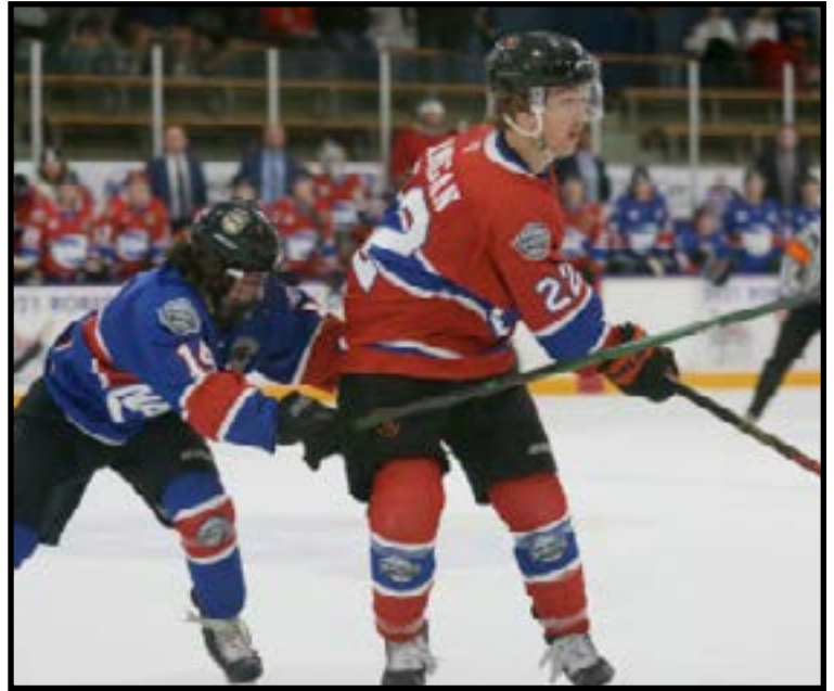
The 2021 NAHL Top Prospects Tournament happened as a result of hard work and collaboration between ownership, staff and players alike.

“They’ve expanded the footprint of the league, which I think is important. It gives an opportunity for colleges located all over the country to see their players. And, they do a real good job with their archived video.”