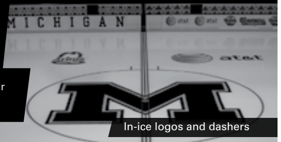
In-ice logos and dashers

Call us and see why businesses nationwide partner with us for their marketing, branding, and merchandising signage needs.