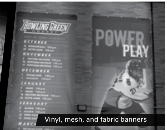
Vinyl, mesh, and fabric banners

SOURCE ONE DIGITAL CAN PROVIDE ATTENTION-GRABBING CUSTOM GRAPHICS FOR YOUR BUSINESS OR TEAM